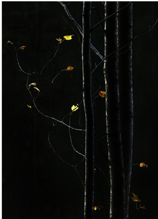
"Dark Trees in Autumn"

Gerry Bishop, Best Creative Digital Projection image .