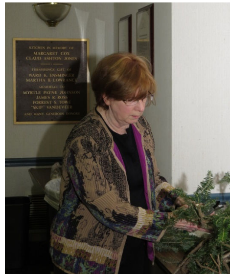
Ginger decorates tables