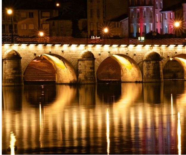
"Bridge at Night, Macon, France"