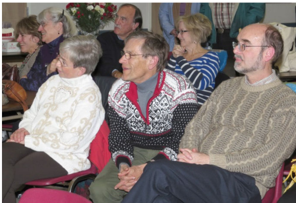
Interested CCC members.