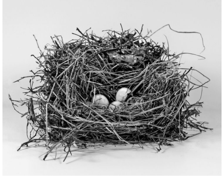
1 st Assigned B, Toni Zappone, "Bird's Nest"