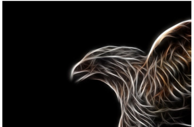
1 st Creative, Rob Fehnel, "Bird of Prey"