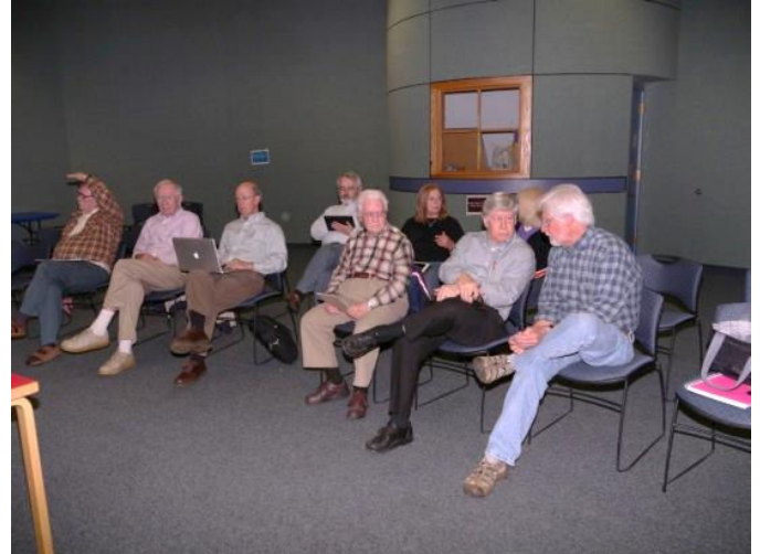
Early arrivals wait for the show to begin.