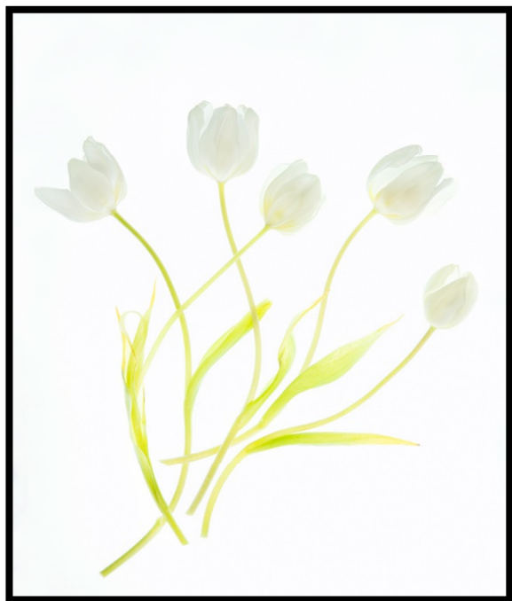
HM Creative, Gerry Bishop "White Tulips on White"