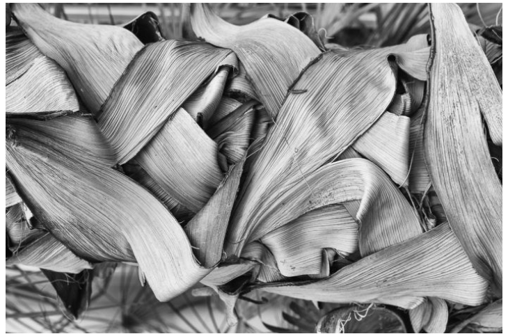
2 nd Assigned B, Beth Bass, "Wrapped"