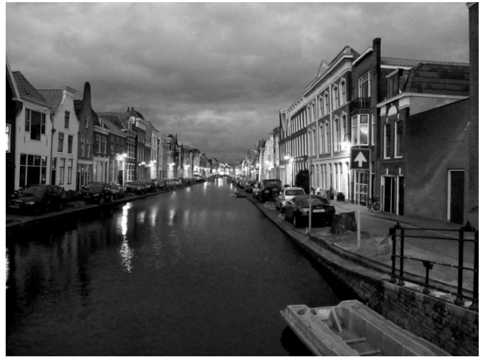
2 nd Open A, Howard Gutgesell, "Gouda Canal"