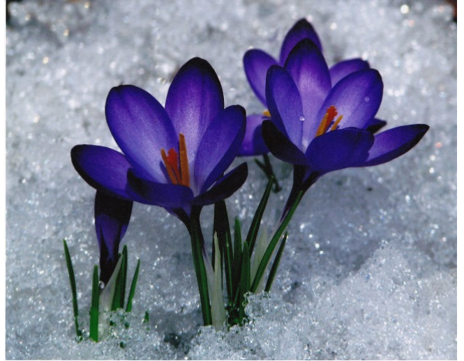
3 rd Open B, Rick Seaman, "Determination"