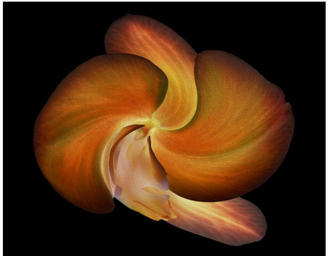
2 nd Creative, Paul Grim, "Ginter Orchid"