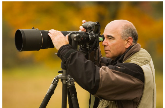
Alan Sislen at Canaan Valley. Web photo.

Alan Sislen is a Washington, D.C. area based photographer specializing in landscape photography, although, he mentions that he often photographs subjects that go beyond traditional landscapes.